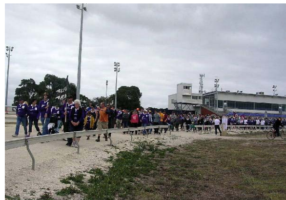
Above: The crowd walks on, despite the dark clouds above them.