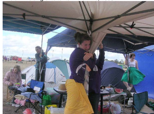
Below: Holding onto tents in the wind, 2008.